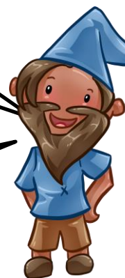
Doc the Dwarf

"As I mentioned to the detective earlier on the phone, she really must stop eating food from strangers."